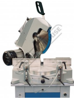
Tilting Head To 45 Degrees