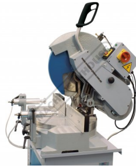
Side View of Head