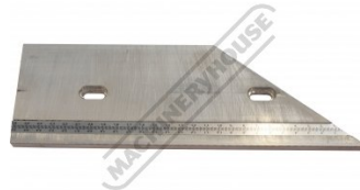
Tilting Head Rear Material Support Included