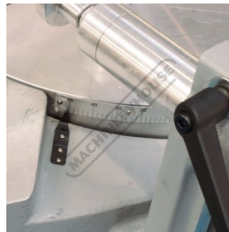
Swivel Head Scale Indicator