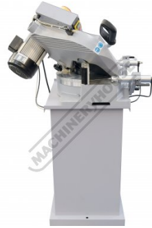
Compound Cut at 45 Degrees Left View