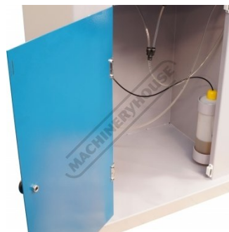
Storage Cabinet With Oil Refill Bottle