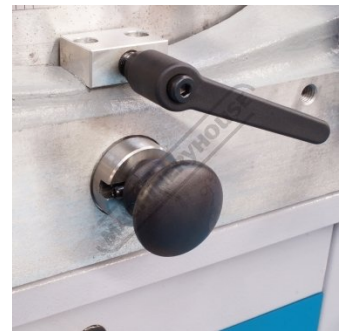
Swivel Head Release