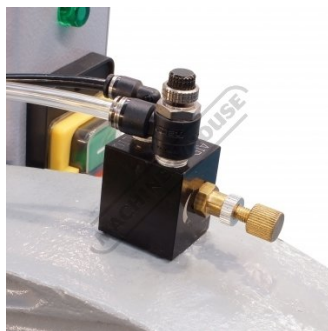
Spray Mist Coolant Control