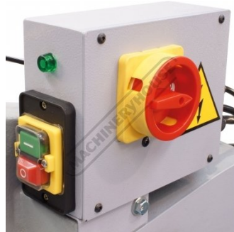
Control Switch Panel