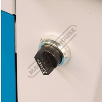
Air Clamp Switch