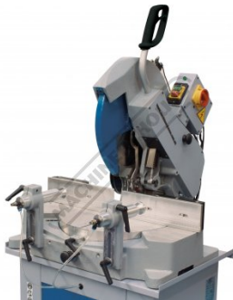
Head Close Up