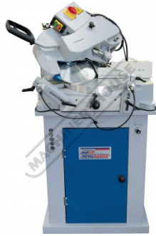
Compound Cut at 45 Degrees