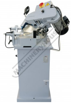
Compound Cut at 45 Degrees Right View