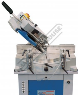
Swivel Head To 45 Degrees