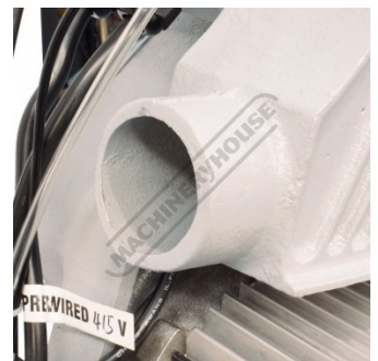
Dust Extraction Chute