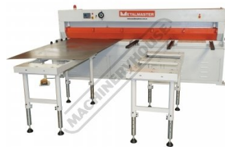
Shown with Optional Ball Transfer Tables - Order Code (L840)