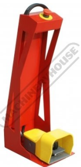
Roving Foot Control