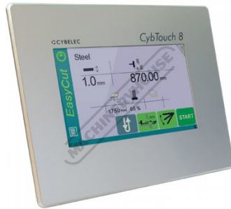
CybeleC Cybtouch 8W Control Unit