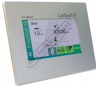
CybeleC Cybtouch 8W Control Unit