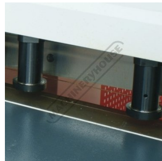
Material Shadow Line