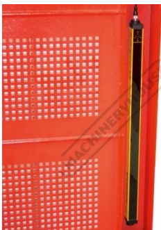
Rear Light Guarding