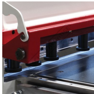
Individual Hold Downs