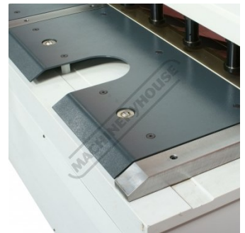
Ball Transfer Table