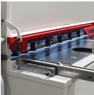
Squaring Arm with Adjustable Stop