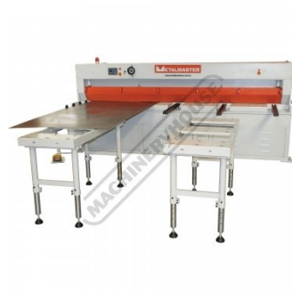
Shown with Optional Ball Transfer Tables - Order Code (L840)