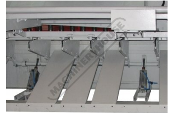
Pneumatic Sheet Support Cylinders Type A