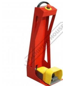
Roving Foot Control