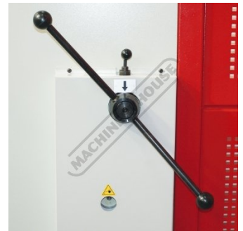
Blade Gap Adjustment Lever