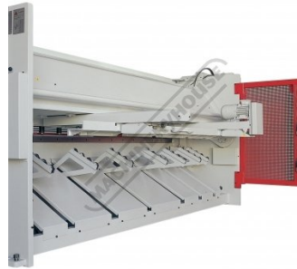
Pneumatic Sheet Supports Type A