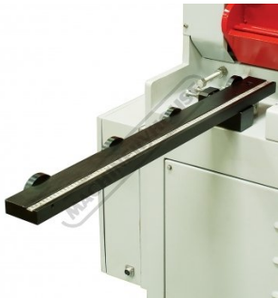
Squaring Arm with Measuring Scale