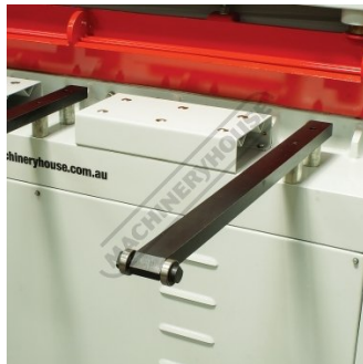
Front Sheet Supports