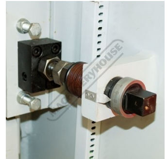
Quick Action Blade Clearance Adjustment