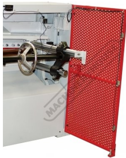
3 Safety Electro Photo Sensors