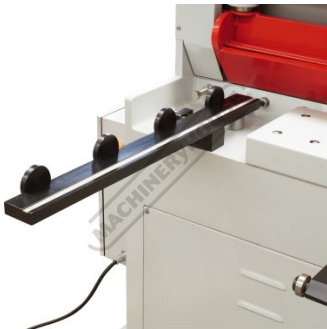
Squaring Arm with Measuring Scale