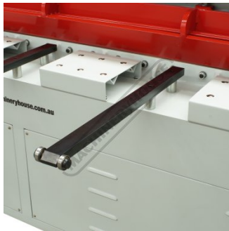
Front Sheet Supports with Roller Bearings