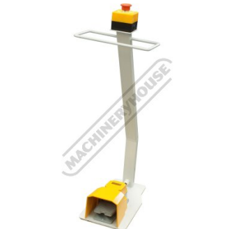
Roving Foot Pedal with Emergency Stop