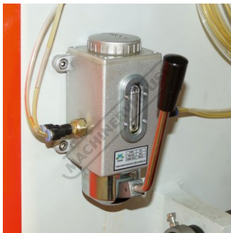
One Shot Lubrication