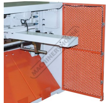
3 Safety Photo Sensors