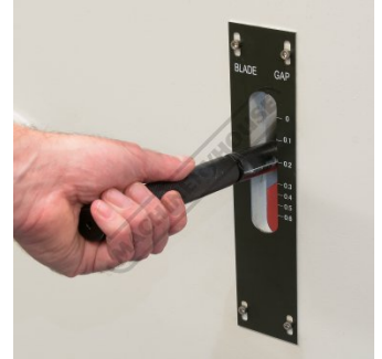
Quick Action Blade Clearance Adjustment