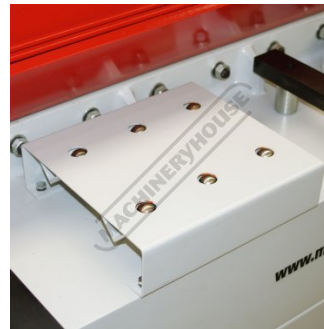
Material Transfer Balls on Table