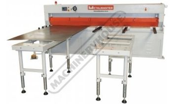
Shown with Optional Ball Transfer Tables - Order Code (L840)