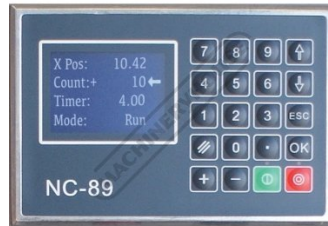
NC 89 Backgauge DRO