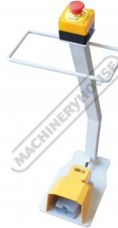
Mobile Foot Control