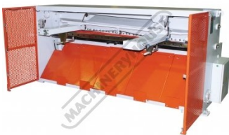
NC-89 Control Backgauge