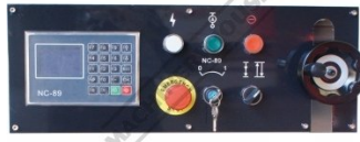
NC 89 Control Panel