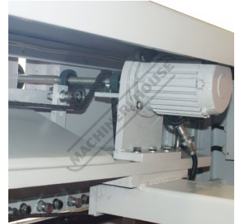
Back Gauge Drive Motor