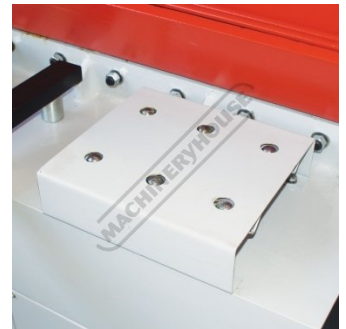
Material Transfer Ball On the Table