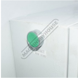
Rear Guard Reset Button