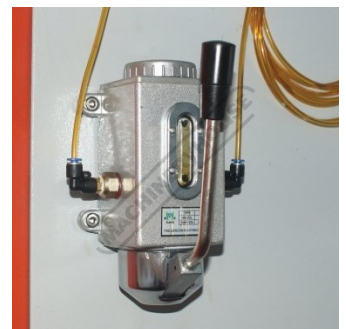
One Shot Lubrication