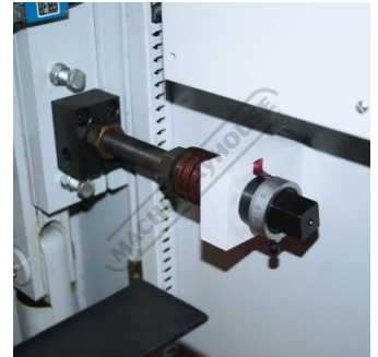
Quick Action Blade Clearance Adjustment