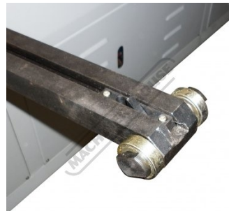
Front Sheet Supports with Roller Bearings