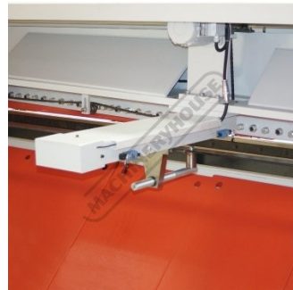
Motorised Backgauge Right View