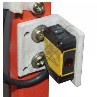
Safety Omron E3ZS Rear Light Sensor Guarding