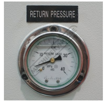
Return Pressure Gauge