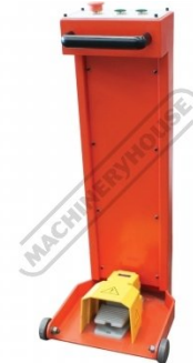
Mobile Foot Control