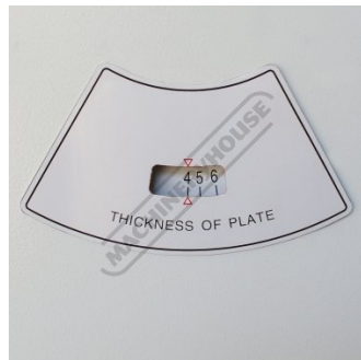
Thickness of Plate Indicator