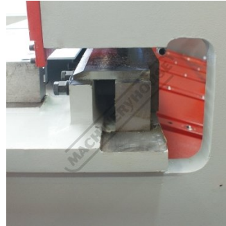
Open Throat for Slitting