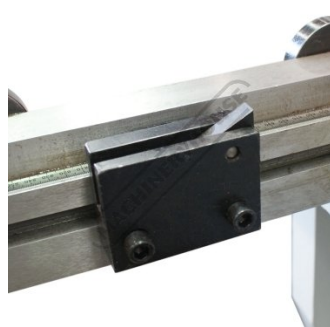
Adjustable Flip Over Stops