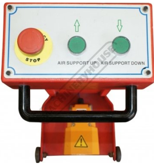
Pneumatic Sheet Support and Emergency Stop on Mobile Foot Control