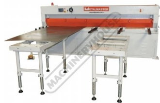
Shown with Optional Ball Transfer Tables - Order Code (L840)