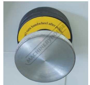
Fine Adjustment Dial for Backgauge