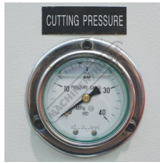
Cutting Pressure Gauge