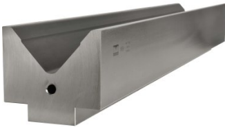
S99244 Dieblock Heavy Duty, Single V 100mm 86 Degrees