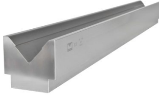
S99240 Dieblock Heavy Duty, Single V 63mm 86 Degrees