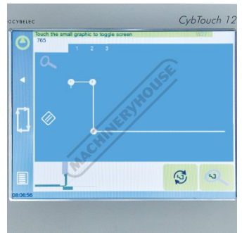
Touch Draw Graphical Programming