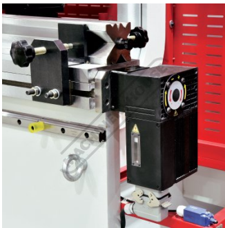
CNC Table Crowning