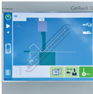
Bend Simulation 2