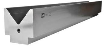
S99242 Dieblock Heavy Duty, Single V 80mm 86 Degrees