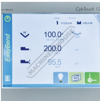
Easy Bend Page