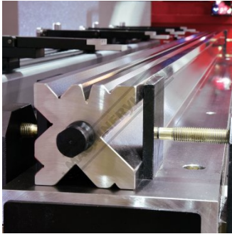
Multi V Die Block