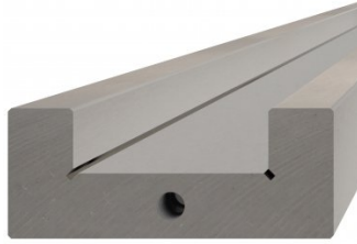
S996B 60mm Die Rail Pressbrake Tooling