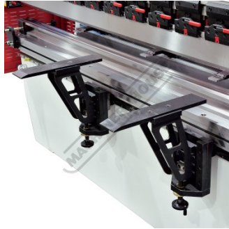
Adjustable Sliding Front Sheet Supports