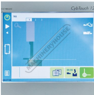
Bend Simulation 1