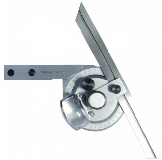
Q201 Universal Bevel Protractor