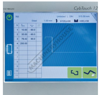
Bend Program List