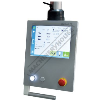
Cyb Touch12 CNC Control