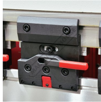
Quick Release Tool Clamps - Change Tools without sliding them all out