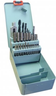
T019 Metric HSS Hand Tap & Drill Set - 29 Piece