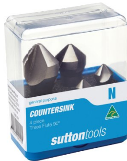
D106 Countersink Sets – 90° Three Flute