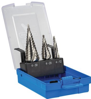
D107 HSS Step Drill Sets