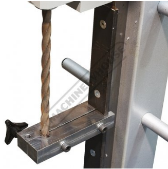
Shown Twisting Square Metal