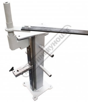
Shown On Optional Stand