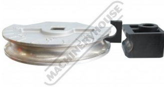
Former & Follower Die Side View