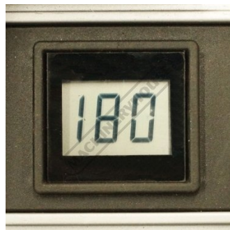
Digital Readout Angle 0~180°