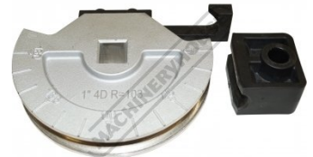
1" Inch Former & Follower Die