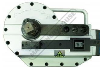
Main Body Top View