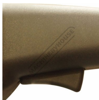
Bending Trigger Switch