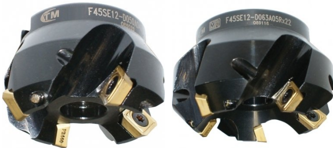
M516 Face Mill 45° - Super High-Rake