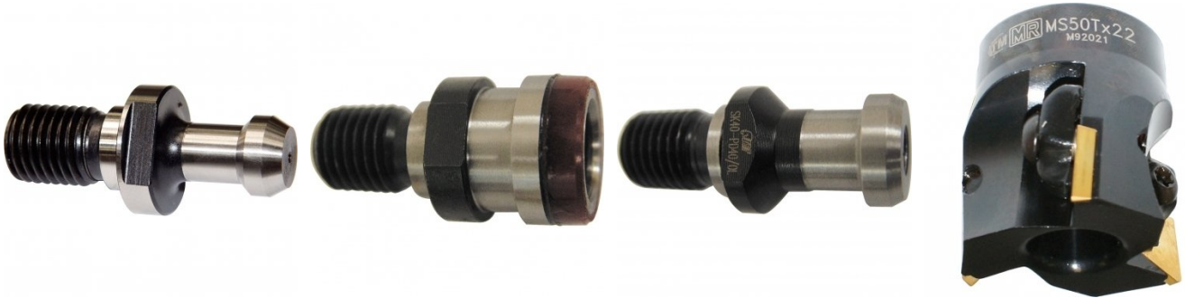
M515 Face Mill 45° - Super High-Rake