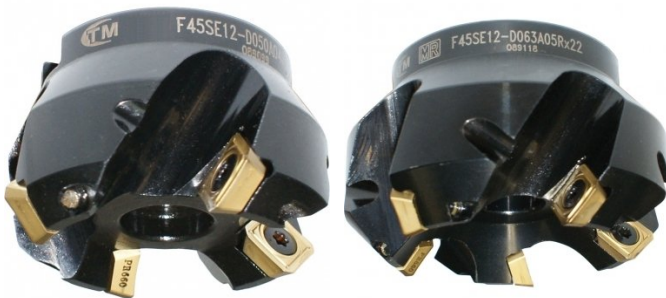
M516 Face Mill 45° - Super High-Rake