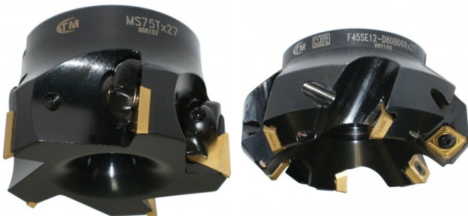
M517 Face Mill 45° - Super High-Rake