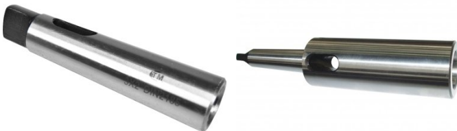
D403 Drill Extension Sleeve - Morse Taper