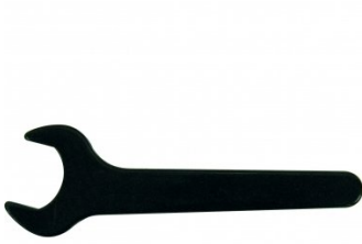
C842 ER20 Collet Chuck Wrench