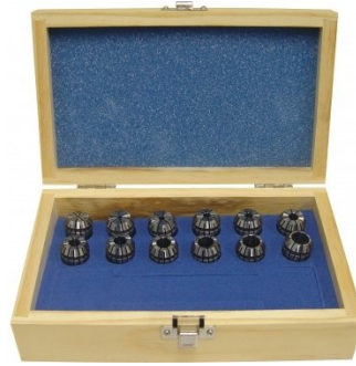
C850 ER20 Collet Set - 12 Piece