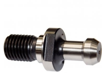
T142 Pull Stud