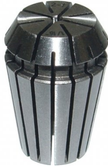
C843 ER20 Collet