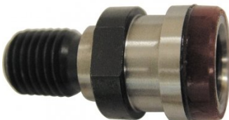
T144 Pull Stud