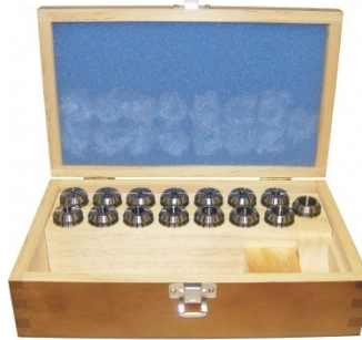
C860 ER25 Collet Set - 15 Piece