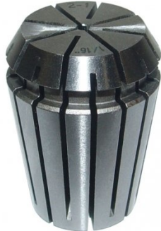
C855 ER25 Collet