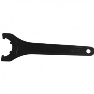
C861 ER25 Collet Chuck Wrench