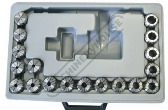
C922 ER32 Collet Set - 18 Piece