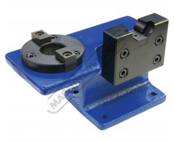
Right Top View