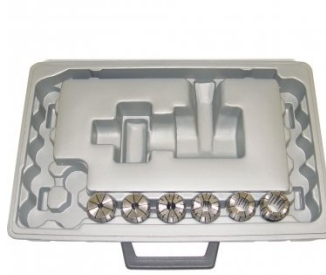
C921 ER32 Collet Set - 6 Piece