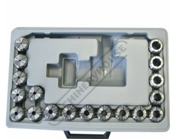
C922 ER32 Collet Set - 18 Piece