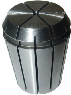
C903 ER32 Collet