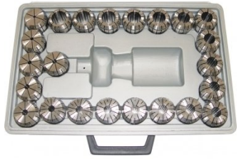
C958 ER40 Collet Set - 23 Piece