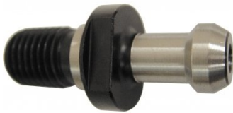
T445 Pull Stud