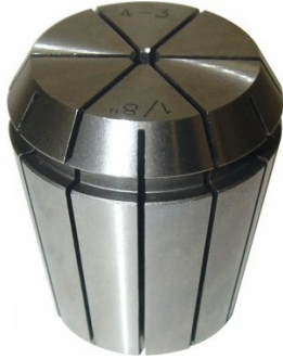
C934 ER40 Collet