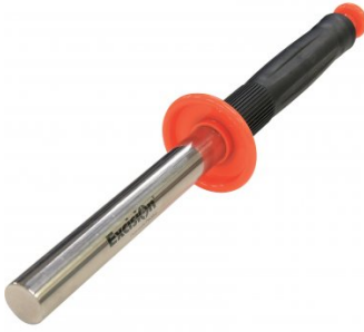
L300 Magnetic Swarf Remover