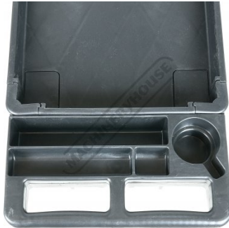
Handle with Storage Compartments