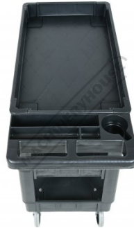
Top Tray View