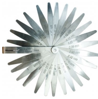
Q616 Feeler Gauge Set