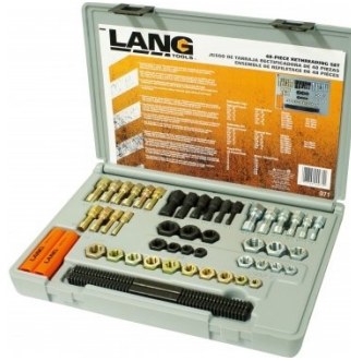
T117 Metric, UNC, UNF Thread Restorer Tap & Die Kit - 48 Piece