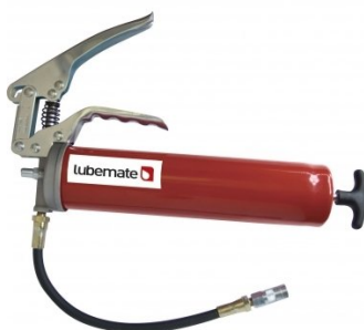
G072 Grease Gun