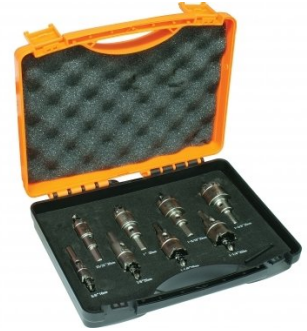
D108 Metric Carbide Tipped Hole Saw Set