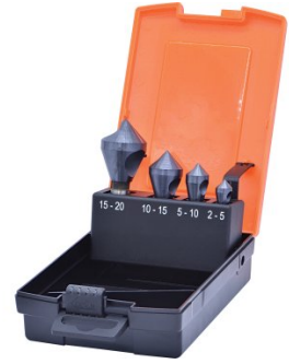
D1051 HSS Countersink Set (90° Cross Hole Type) - 4 Piece