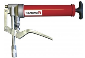
G070 Grease Gun