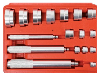
P030 Bush Driver Set - 17 piece