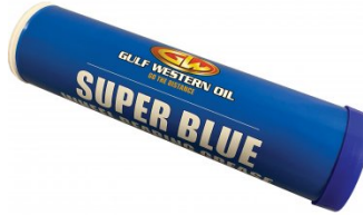
G057 Super Blue Complex Grease Cartridge