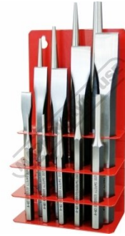
P364 Punch & Cold Chisel Set - 14 Piece