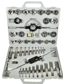
T014 Metric Alloy Steel Tap & Die Set - 45 Piece