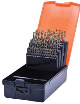
D1285 Metric 135° Precision HSS Drill Set - 51 Piece