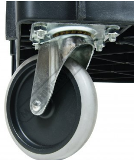
2 x Swivel Wheels