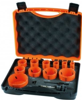
D102 Metric HSS Hole Saw Set