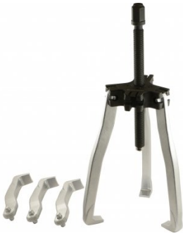
P005 Ratcheting Gear Puller Set