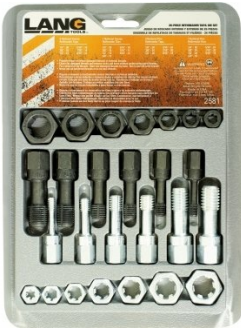
T116 Imperial Thread Restorer Tap & Die Kit - 26 Piece Set