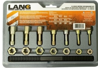
T115 Metric Thread Restorer Tap & Die Kit - 15 Piece