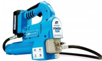
G067 Lithium-ion Battery Operated - Grease Gun