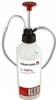
G076 Top Up Pump