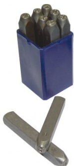
P355 Number Punches