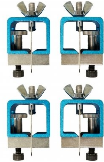
W113 Butt Welding Aluminium & Steel Clamp Set