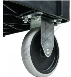
2 x Fixed Wheels