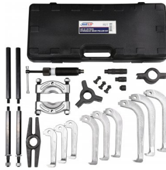
P011 Hydraulic Gear Puller Kit