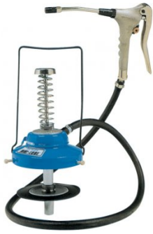
G060 Grease Gun