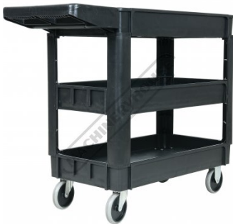
Three Storage Trays