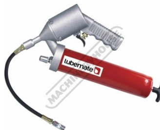
G074 Air Operated Grease Gun