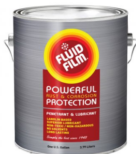
O044 Rust & Corrosion Preventive