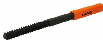
T119 Metric Thread Restorer File