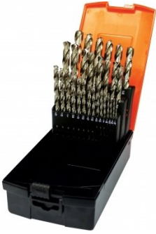
D1282 Imperial 135° Precision HSS Drill Set - 29 Piece