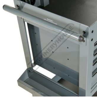
Cart Handle-Side Tray