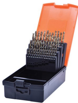
D1285 Metric 135° Precision HSS Drill Set - 51 Piece