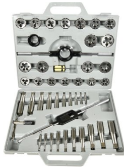
T014 Metric Alloy Steel Tap & Die Set - 45 Piece