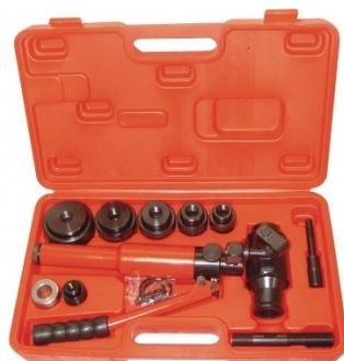
P020 Hydraulic Chassis Punch Set