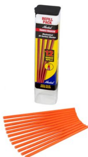
W104A Orange Trades Marker Refills - All Purpose