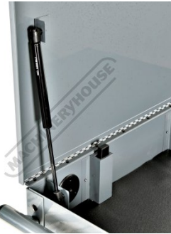
Gas Strut Lid