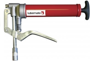
G070 Grease Gun