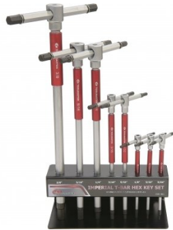
H821 Imperial Hex Key Set with T-Bar Handle