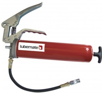
G072 Grease Gun