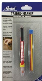
W104 Trades Marker - All Purpose