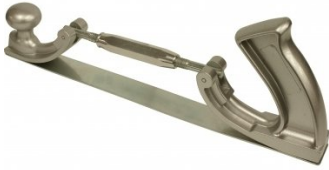
F150 Flexible Body File Holder