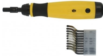
D060 Deburring Tool - Telescopic Shaft