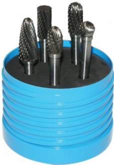
B900 Carbide Burr Double Cut Set - Short Series