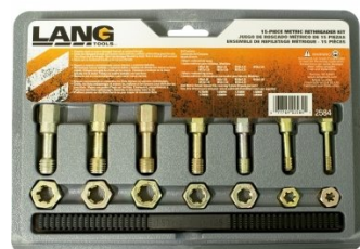
T115 Metric Thread Restorer Tap & Die Kit - 15 Piece