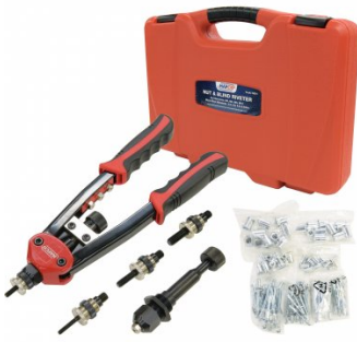
N001 Nut & Blind Riveter Set - 130 Piece