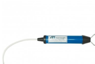
G065 Suction Gun - Oil Transfer