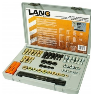
T117 Metric, UNC, UNF Thread Restorer Tap & Die Kit - 48 Piece