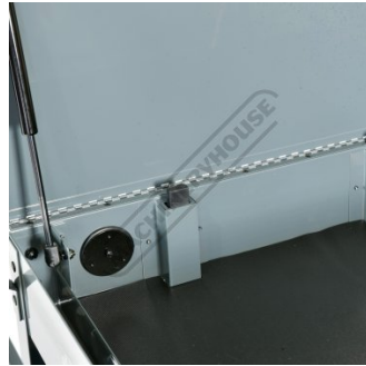
Draws Lock When Lid Closed