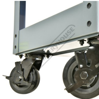
Wheels With Brake System