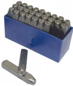
P350 Letter Punches