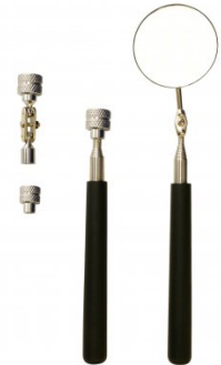
M0009 Magnetic Pick Up Tool & Inspection Mirror Set