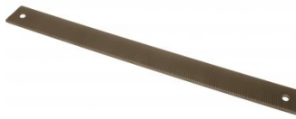
F156 Flexible Body File