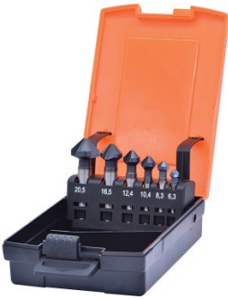
D1061 HSS Countersink Set (90° 3 Flute Type) - 6 Piece