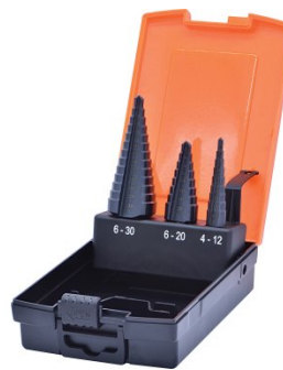
D1071 HSS Sheet Metal Step Drill Set - 3 Piece