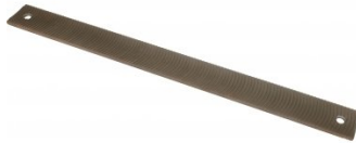
F155 Flexible Body File