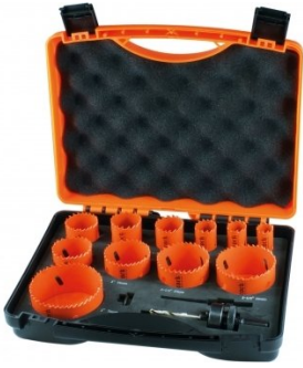
D102 Metric HSS Hole Saw Set