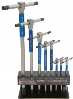
H820 Metric Hex Key Set with T-Bar Handle