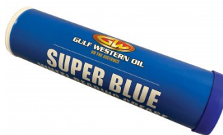
G057 Super Blue Complex Grease Cartridge