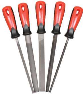
F100 Engineers Files, 5 Piece Set - Second Cut