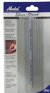
W104B Silver Streak - Welders Pencil