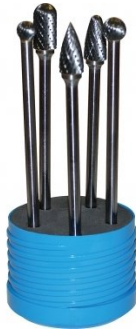
B905 Carbide Burr Double Cut Set - Long Series