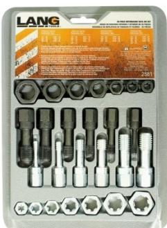
T116 Imperial Thread Restorer Tap & Die Kit - 26 Piece Set