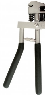
S200 Joggler & Punch Plier