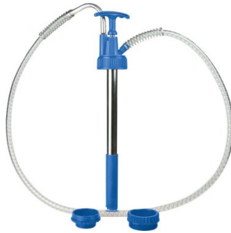
G077 Oil Transfer Pump