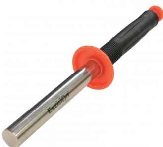
L300 Magnetic Swarf Remover