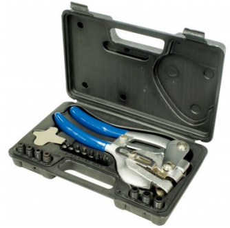
P112 Hole Punch Set