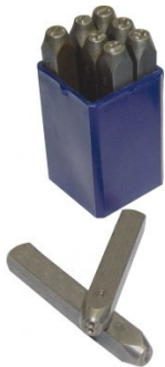
P355 Number Punches