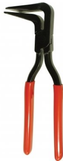
S205 90° Edge/Seaming Plier