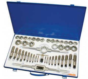
T016 Metric HSS Tap & Die Set - 45 Piece