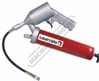
G074 Air Operated Grease Gun