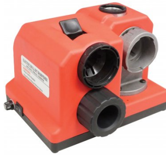
D070 Drill Sharpener