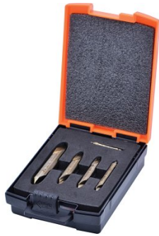
D508 HSS Industrial Centre Drill Set – 5Pcs