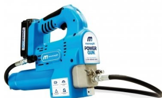
G067 Lithium-ion Battery Operated - Grease Gun