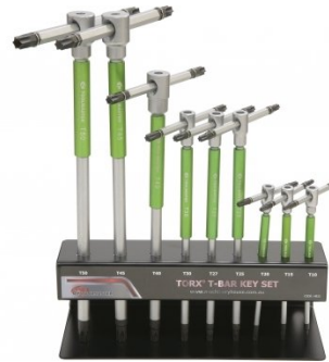
H822 Torx® Key Set with T-Bar Handle