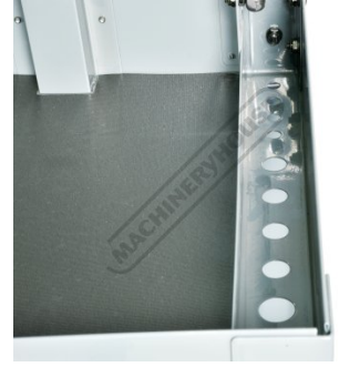
Internal Screwdriver Storage