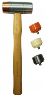
H875 Soft Face Hammer - 5 piece