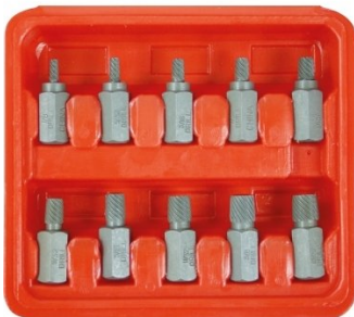
T870 Screw Extractor Set - 10 piece