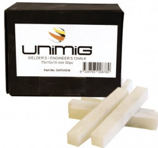
W103 Engineers Chalk Marker- 50 Splits