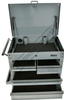
Protective Draw Lining