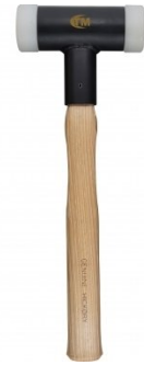
H880 Dead Blow, Nylon Face Hammer