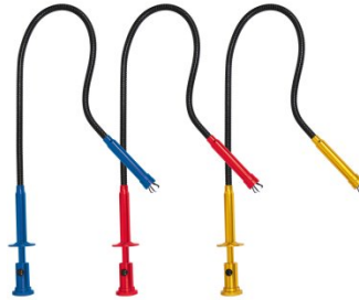
M0010 Pick Up Tool with Magnetic Head & 1 x LED Light