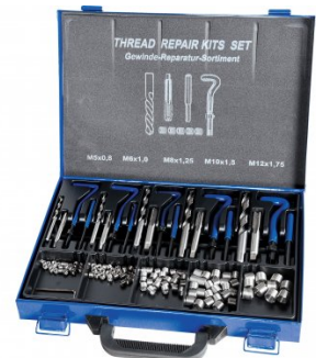
T100 Metric Thread Repair Kit - 130 Piece