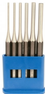
P365 Pin Punch Set - 6 Piece