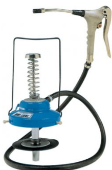
G060 Grease Gun