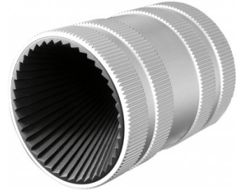
D068 Pipe/Tube Deburring Tool - Internal / External