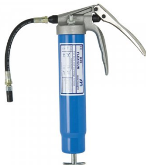
G063 Grease Gun