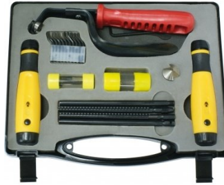
D065 Universal Deburring Tool Set - 23 Piece