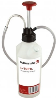
G076 Top Up Pump