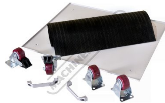
Optional Wheel-Handle Kit (T7689)