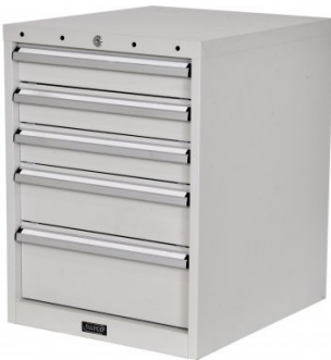
T7685 5 Drawer - Tooling Cabinet