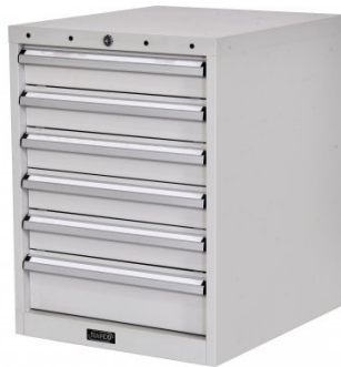
T7680 Tooling Cabinet