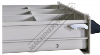
Safety Lock On Draws