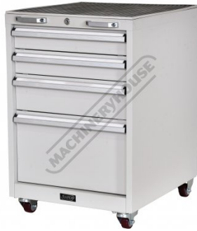
Shown With Optional Wheel Kit