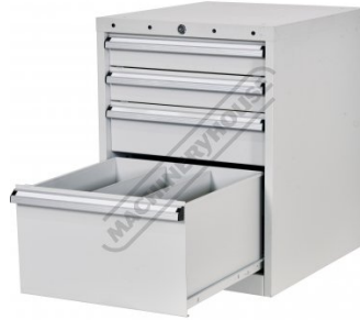
Large Lower Draw