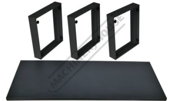
Optional Kick Board-Benchtop (T7690)