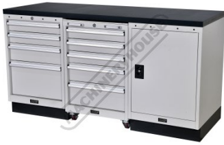
Optional Combination Setup