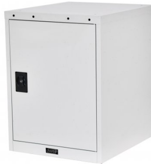
T7680 Tooling Cabinet