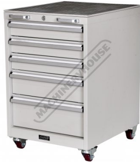
Shown With Optional Wheel Kit