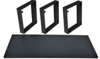
T7690 Bench Top & Kick Board Kit