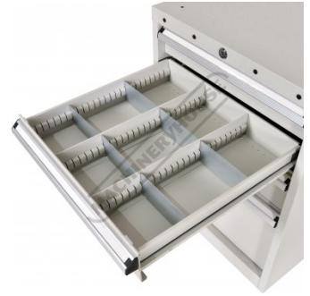
Draws With Adjustable Steel Dividers