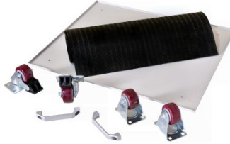
T7689 Cabinet Trolley Kit