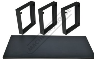
Optional Kick Board & Benchtop Kit