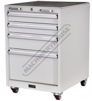
Shown With Optional Cabinet