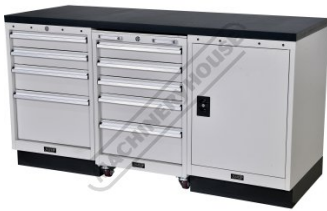
Optional Combination Setup