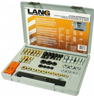
T117 Metric, UNC, UNF Thread Restorer Tap & Die Kit - 48 Piece