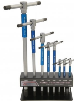
H820 Metric Hex Key Set with T-Bar Handle