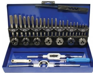
T012 Metric Alloy Steel Tap & Die Set - 32 Piece