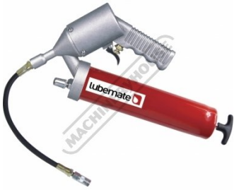
G074 Air Operated Grease Gun