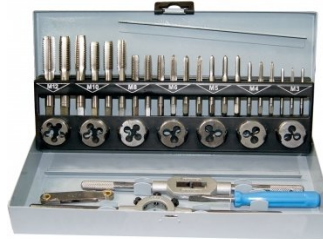
T013 Metric HSS Tap & Die Set - 32 Piece