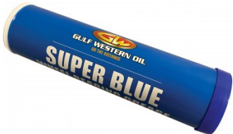
G057 Super Blue Complex Grease Cartridge