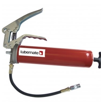
G072 Grease Gun