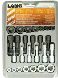
T116 Imperial Thread Restorer Tap & Die Kit - 26 Piece Set