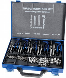
T100 Metric Thread Repair Kit - 130 Piece