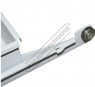
Drawer Ball Bearing Arms