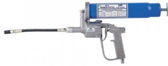
G066 Air Operated Power Pistol - Grease Gun