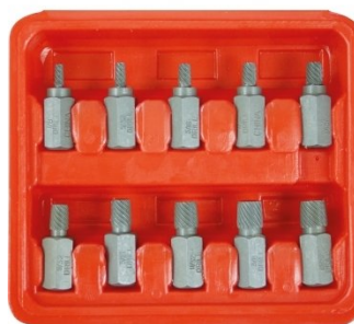
T870 Screw Extractor Set - 10 piece