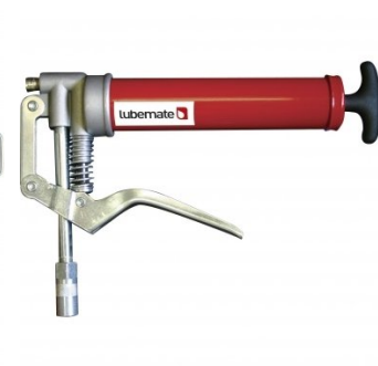
G070 Grease Gun