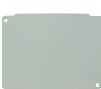
T787 Steel Divider