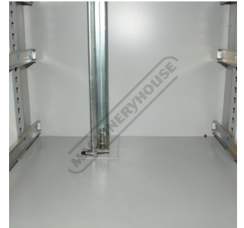
Drawer Locking Mechanism