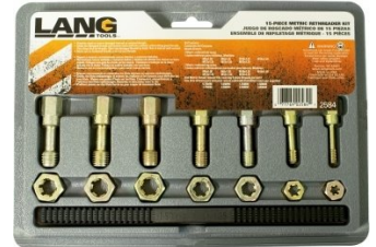
T115 Metric Thread Restorer Tap & Die Kit - 15 Piece