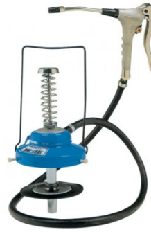
G060 Grease Gun