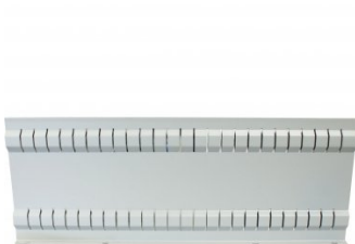
T788A Slotted Rail