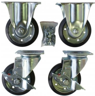
T776 Wheel Kit - Ø125mm