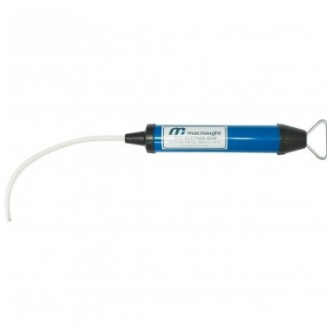
G065 Suction Gun - Oil Transfer