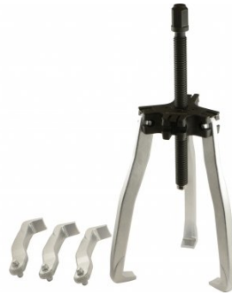
P005 Ratcheting Gear Puller Set