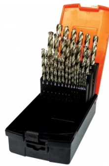
D1282 Imperial 135° Precision HSS Drill Set - 29 Piece