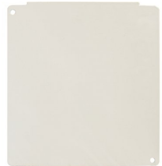
T788 Steel Divider