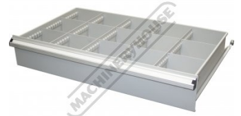
Drawers with Steel Dividers