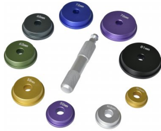
P031 Bearing Race & Seal Driver Set - 10 piece