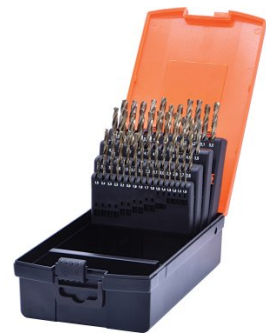
D1285 Metric 135° Precision HSS Drill Set - 51 Piece