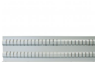
T787A Slotted Rail