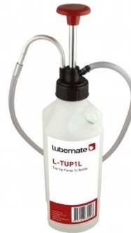
G076 Top Up Pump