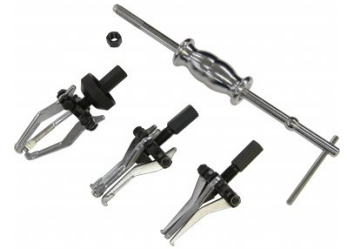
P013 Puller Set with Slide Hammer