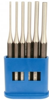
P365 Pin Punch Set - 6 Piece