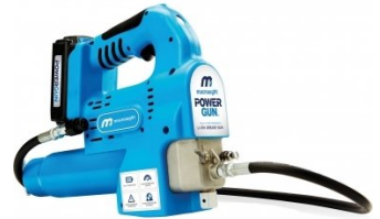
G067 Lithium-ion Battery Operated - Grease Gun