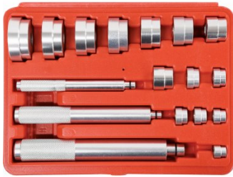
P030 Bush Driver Set - 17 piece