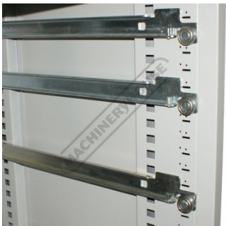
Heavy Duty Drawer Slides