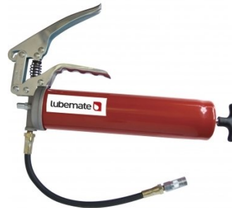
G072 Grease Gun