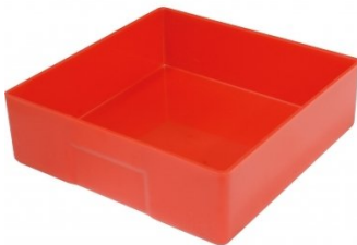
A429 Plastic Bucket