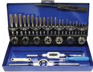
T012 Metric Alloy Steel Tap & Die Set - 32 Piece