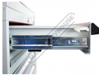
Ball Bearing Slides