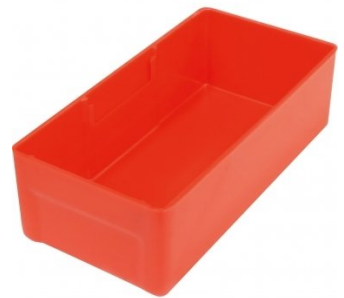
A428 Plastic Bucket