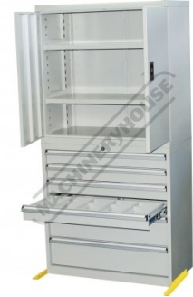
Shown with Optional (T774) Storage Cabinet Optional