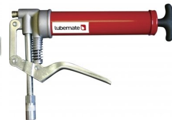
G070 Grease Gun