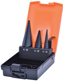
D1071 HSS Sheet Metal Step Drill Set - 3 Piece