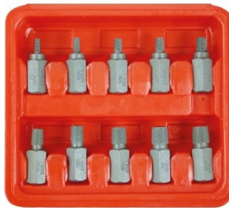
T870 Screw Extractor Set - 10 piece