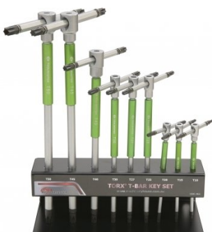
H822 Torx® Key Set with T-Bar Handle