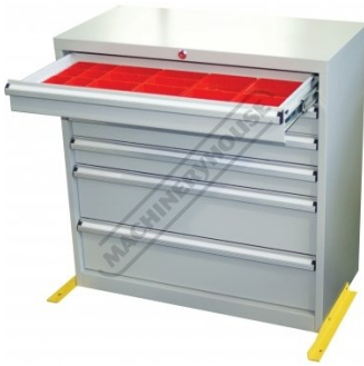
Top Drawer with Plastic Buckets