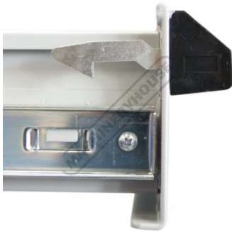
Concealed Safety Hook