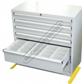
200mm Drawers with Steel Dividers