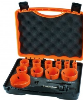
D102 Metric HSS Hole Saw Set