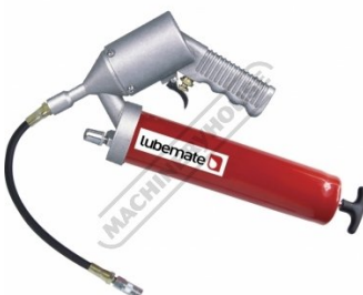
G074 Air Operated Grease Gun