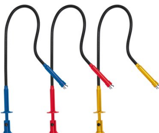
M0010 Pick Up Tool with Magnetic Head & 1 x LED Light