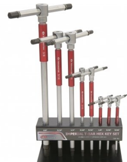
H821 Imperial Hex Key Set with T-Bar Handle