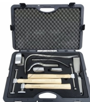
H887 Auto Panel Restoration Kit - Master