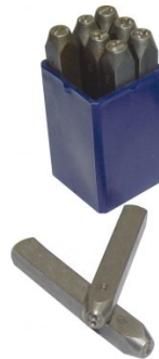
P355 Number Punches