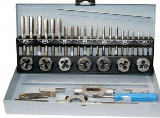
T013 Metric HSS Tap & Die Set - 32 Piece