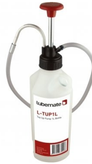
G076 Top Up Pump