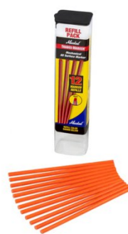
W104A Orange Trades Marker Refills - All Purpose