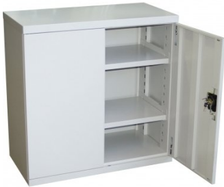
T774 Industrial Storage Cabinet