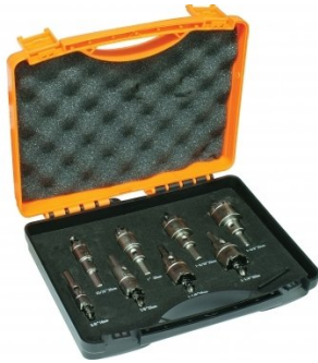
D108 Metric Carbide Tipped Hole Saw Set