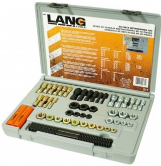
T117 Metric, UNC, UNF Thread Restorer Tap & Die Kit - 48 Piece