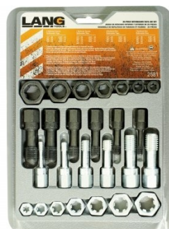
T116 Imperial Thread Restorer Tap & Die Kit - 26 Piece Set