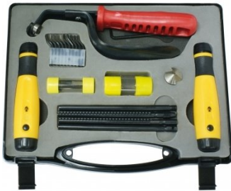
D065 Universal Deburring Tool Set - 23 Piece