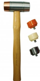
H875 Soft Face Hammer - 5 piece