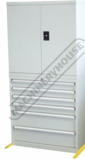
Shown with Optional (T774) Storage Cabinet Optional