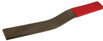
F160 Slapping File - Second Cut