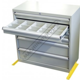
100mm Drawer with Steel Dividers