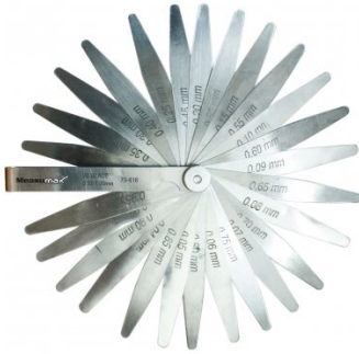
Q616 Feeler Gauge Set