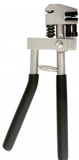
S200 Jogger & Punch Plier