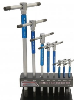
H820 Metric Hex Key Set with T-Bar Handle