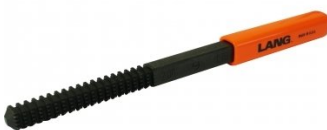
T120 Imperial Thread Restorer File