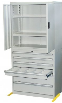
K033 Industrial Storage & Tooling Cabinet Package Deal