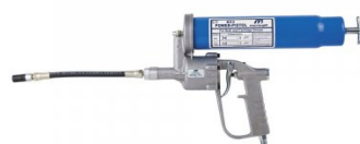
G066 Air Operated Power Pistol - Grease Gun