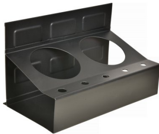
T703 Magnetic Spray Can & Screwdriver Holder