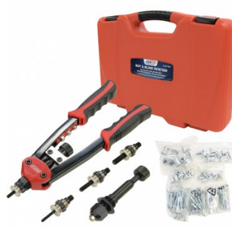
N001 Nut & Blind Riveter Set - 130 Piece