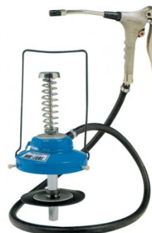
G060 Grease Gun