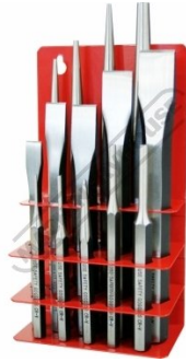
P364 Punch & Cold Chisel Set - 14 Piece