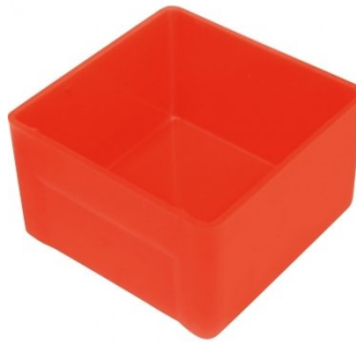
A427 Plastic Bucket