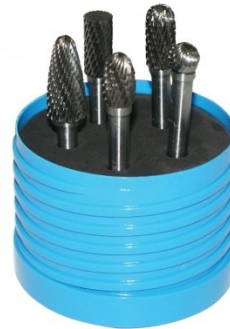
B900 Carbide Burr Double Cut Set - Short Series