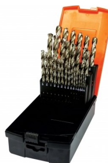
D1282 Imperial 135° Precision HSS Drill Set - 29 Piece