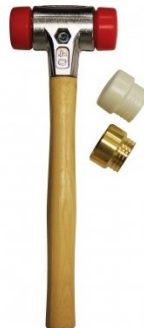
H870 Soft Face Hammer