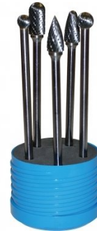
B905 Carbide Burr Double Cut Set - Long Series