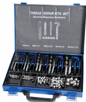
T100 Metric Thread Repair Kit - 130 Piece