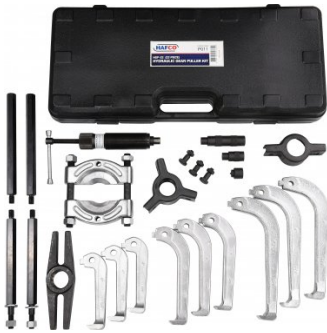
P011 Hydraulic Gear Puller Kit