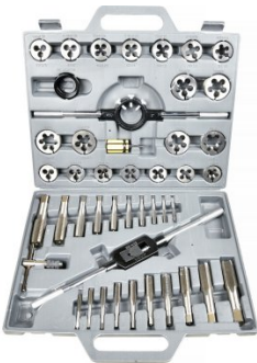
T015 Imperial Alloy Steel Tap & Die Set - 45 Piece