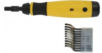
D060 Deburring Tool - Telescopic Shaft