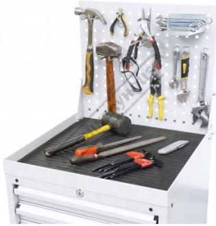
Shown Setup - Tools & Accessories Not included