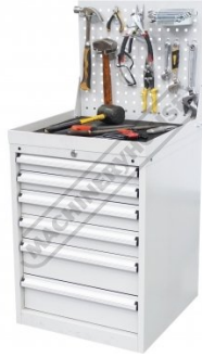
Shown with Optional Hooks & Cabinet - Tools Not Included