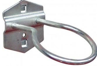
A444 Plier Holder - Triple Prong