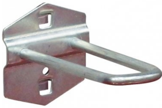
A4496 Round Tool Holder - Loop