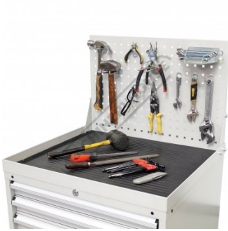
Shown with Optional Hooks - Tools Not Included