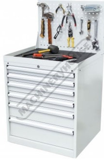
Shown with Optional Hooks & Cabinet - Tool Not Included