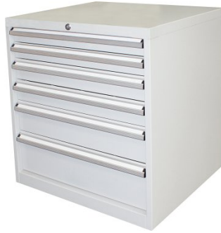
T767 6 Drawer - Industrial Tooling Cabinet