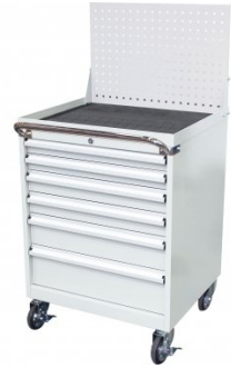
K068 6 Drawer - Industrial Mobile Tooling Cabinet with Backing Panel Package Deal