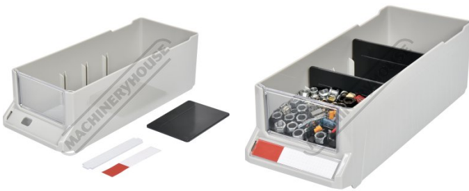
Parts Bin Dividers and Name Tags Parts Bin 90 x 218 x 70mm