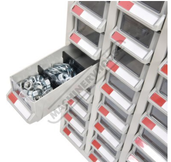
Drawer with Dividers Shown with Parts