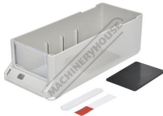
Parts Bin Dividers and Name Tags