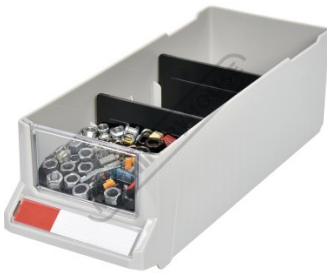
Parts Bin 90 x 218 x 70mm