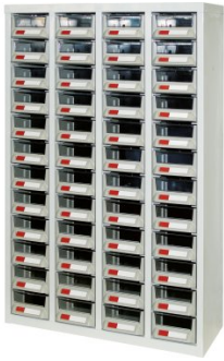
T7956 Parts Storage Bins