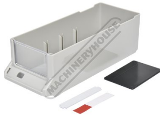
Parts Bin Dividers and Name Tags