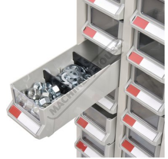
Drawer with Dividers Shown with Parts