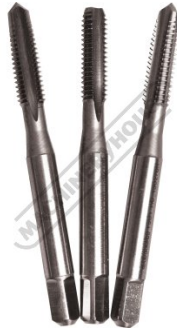
Starter Intermediate & Plug Tap