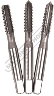
Starter Intermediate & Plug Tap