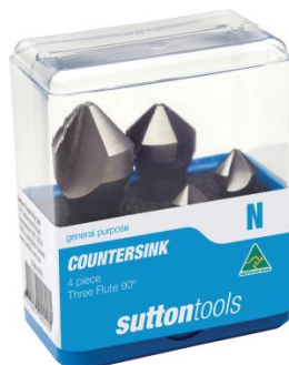
D106 Countersink Sets – 90° Three Flute