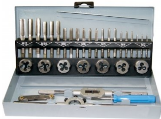
T014 Metric Alloy Steel Tap & Die Set - 45 Piece