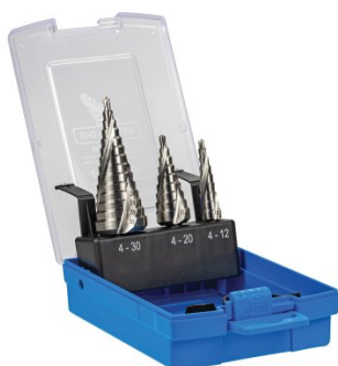
D107 HSS Step Drill Sets