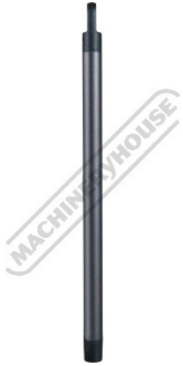
Slim Line Design