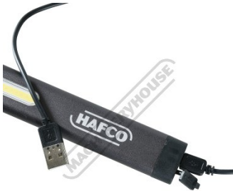
USB Charge Port