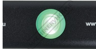
Power Light Indicator