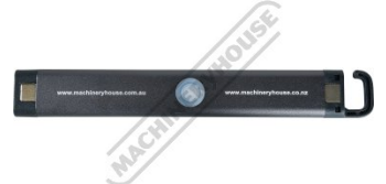
Two Magnetic Points