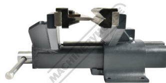
Shown on V0924