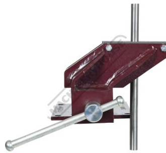
Vertical Work Without Obstruction