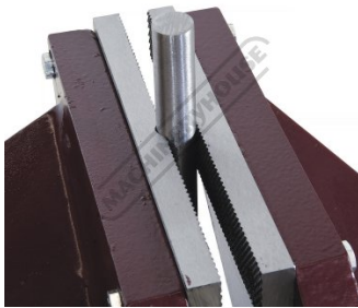
Pipe Vice Jaws