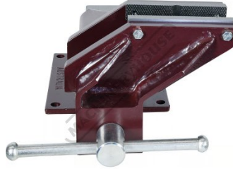
Offset Vice Jaws