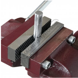
Pipe Vice Jaws