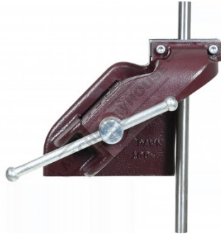
Vertical Work Without Obstruction