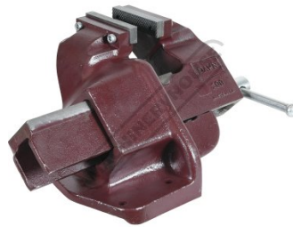
Rear Right View