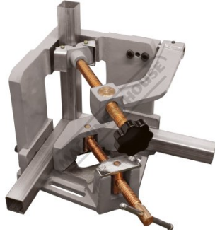
Shown With Box Tubing