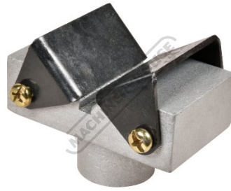
Included Larger Clamp Attachment