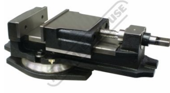
Shown without Handle