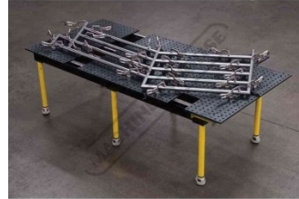
Shown with Optional Clamps Fixtures