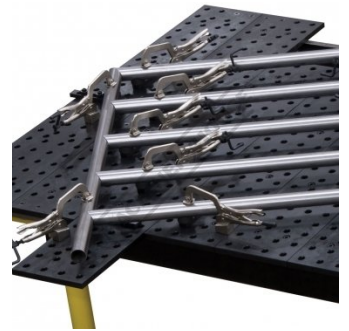
Shown with Optional Clamps Fixtures Close Up