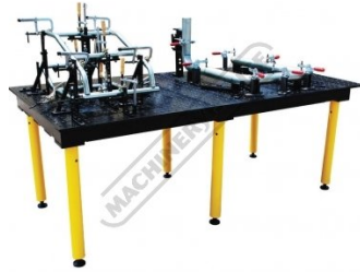
Set Up Heavy Duty Large or Complex Fixtures