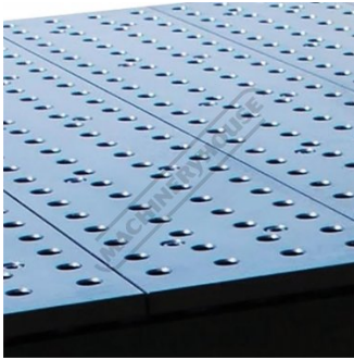
33 Percent more CNC Machined Holes