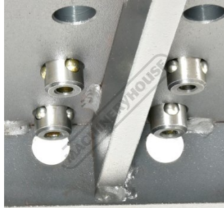
Bottom View on Welding Table