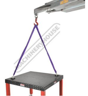
Shown Using Optional Lifting Kit