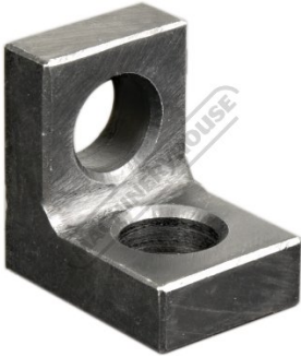
Angle Bracket 40x40x30mm